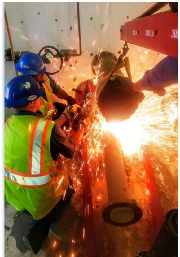
Water Operators Cutting Ductile Iron

Water costs include in part: (1) payments made to Fountain Valley Authority pursuant to a contract with the Authority to provide approximately 1,500-acre feet (AF) per year, (2) payments made to well owners pursuant to a Master Water Lease to provide a minimum of 1,000